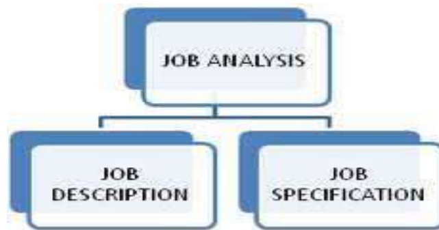
Chart 1 Type of Job Analysis