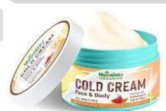
Fig: 1 Cold Cream