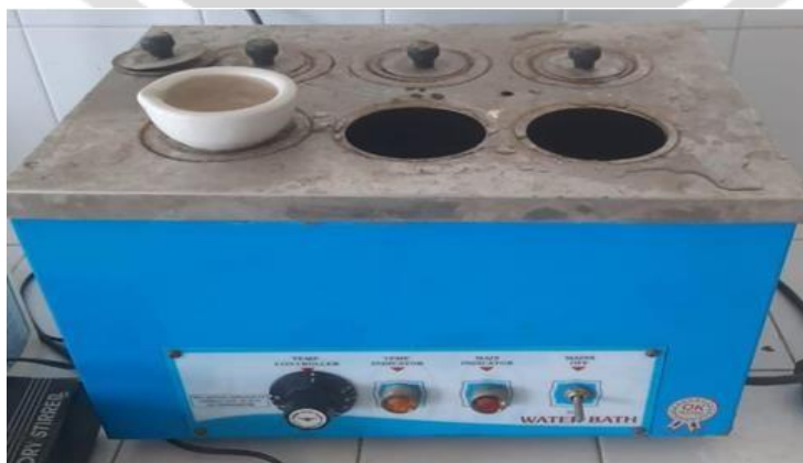
Fig 3 Hot Water Bath

After melting the beeswax and making it miscible with the liquid paraffin, we combined the two materials using a glass rod and heated the mixture in a water bath at 70°C