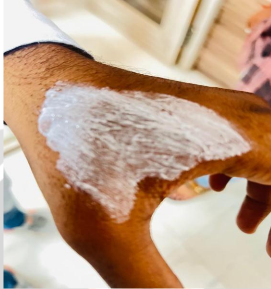
Fig 5Sensitivity test