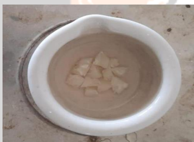
Fig 2 Bees Wax

After melting the beeswax and making it miscible with the liquid paraffin, we combined the two materials using a glass rod and heated the mixture in a water bath at 70°C