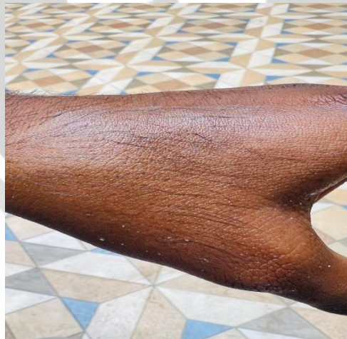
Fig 6 Result after the sensitivity test