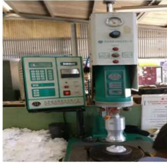
Fig.3 Ultrasonic Welding Setup