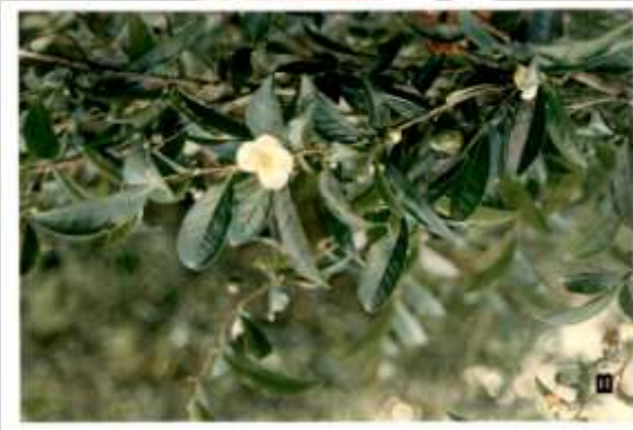
Figure 2 A tea plant growing under natural conditions (neither harvested nor pruned)

The heterogeneous mix of mutts from mental quality (L) O have a place among all money-moved tea plants. Koste that have nearly none, erect green leaves, sweet, light green, long, level or semi-erect leaves, Koste (Masters) Wight, and C. The wats are typically elliptical, upright and denticulate leaves with incurved, dull teeth tipped around the margins. These are most of the three that are given as the "China" as it is, the "Assam" and the "Combod" (Jats). The tea plant has regular requirements and has a standard speed structure between 3 and 5 years at a height of 9 m or usually more. Enthusiastic shoots of 2-3 sheets and a bud are 'winnowed' at 1-3 weeks, are prone to coolness and are supervised in the numerous patterns in plants that create dull or green tea.