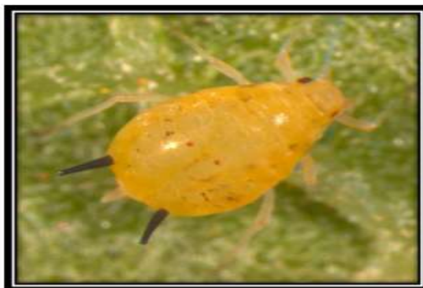
Figure 1: A Gossypii Glover.