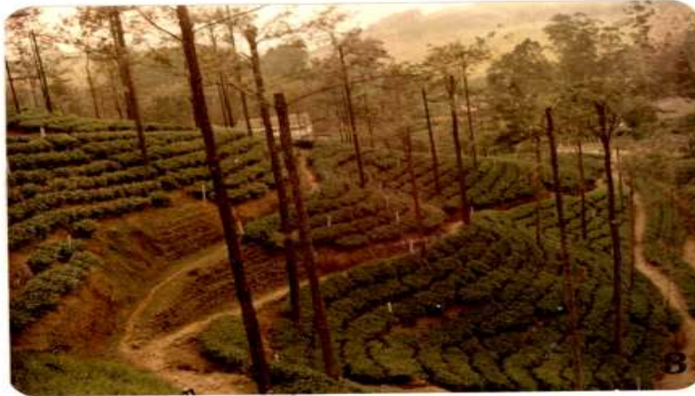
Figure 4 Tea bushes recovering from pruning

of Karnatik, Kerala and Tamil Nadu, the tea ranches are scattered across the hills of the West Ghats, covering a surface area of around 75,000 ha.