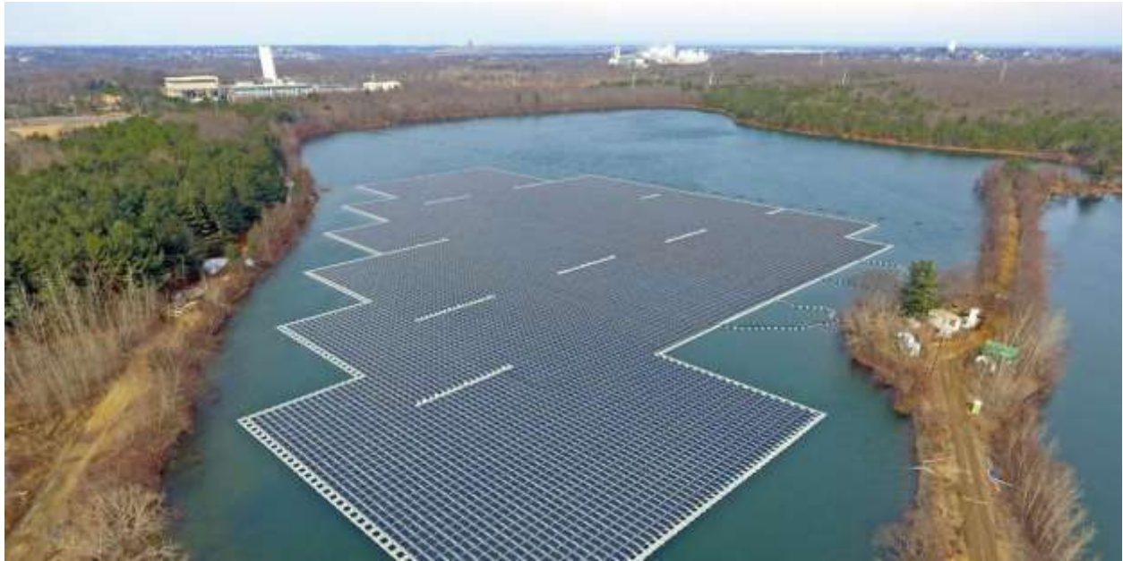
America's largest floating solar project completed

Ciel & Terre USA has completed a 4.4. MW floating solar array in Sayreville, New Jersey, the largest of such a project in North America. This is an important step for a technology that NREL predicts could reach 9.6% of current electricity generation.