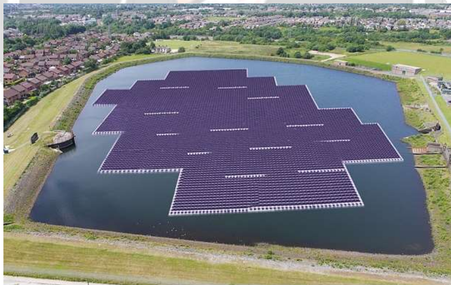
AN ARTIST'S IMPRESSION OF THE FLOATING SOLAR FARM AT GODLEY RESERVE, MANCHESTER.

It is needed to be doing more in the UK and big energy businesses need to go for it if the UK is going to survive and keep up in the future, they are falling behind and really need to analyse why? There are good things happening but it is all too, too slow much Like brexit.