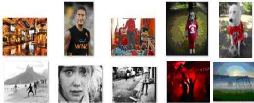
Fig -1: Some examples from NUS-WIDE database

candidate ranking list to accomplish the relevance-quality based ranking. Experimental results on NUS-WIDE image collection demonstrate the effectiveness of the proposed approach.