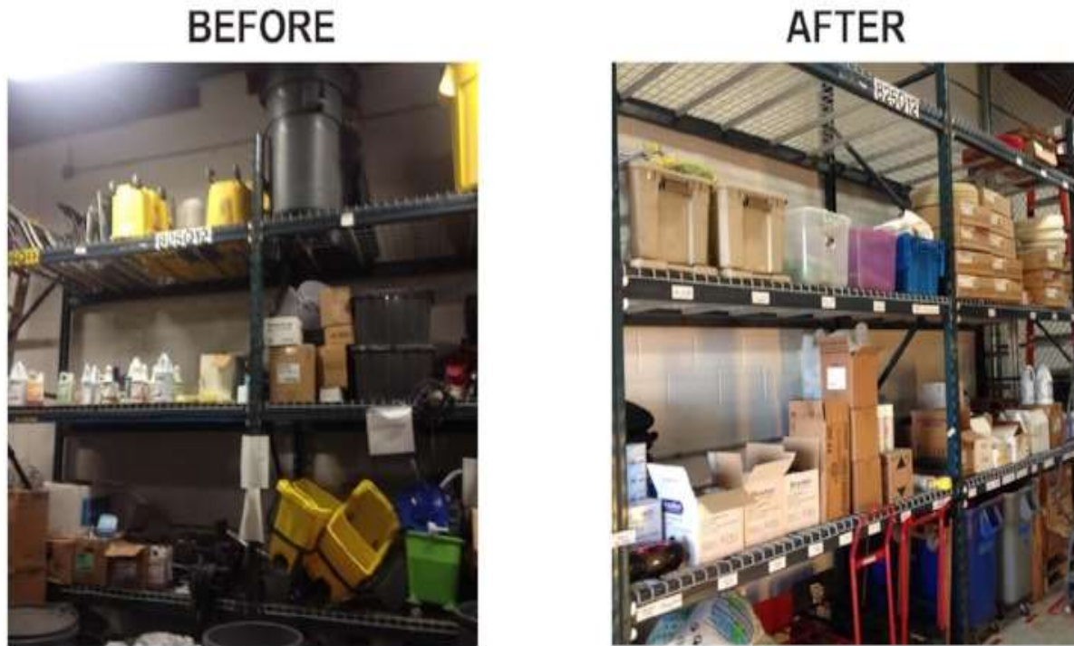
Fig -2: Before and after apply 5S

check is carried out using the so-called 5S Radar Chart and Checklist created on its basis, which is used to assess the workplace.