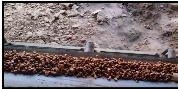
Figure 1. Lightweight expanded clay aggregate (LECA)

Lightweight expanded clay aggregate (LECA) is a lightweight aggregate made by heating clay to around 1,200 °C (2,190 °F) in a rotary kiln. The yielding gases expand the clay by thousands of small bubbles forming during heating producing a honeycomb structure. LECA has an approximately round or potato shape due to circular movement in the kiln and is available in different sizes and densities. LECA is used to make lightweight concrete products and other uses.