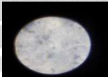
Fig microscope test

how we identify the graphene in microscope test we have to see the structure as we all know that graphene has the property to absorb the light this way we have identified the material