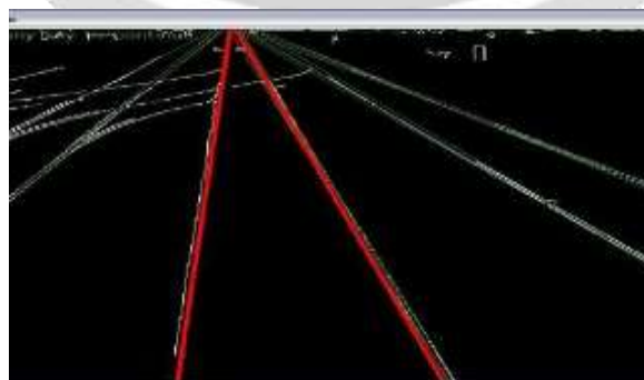
Fig.b.Hough line Transform

Hough line transform: Using an appropriate edge to find all the edge points in the picture scheme for detection. Quantize the space of m, c into a two dimensional matrix H with suitable levels of quantization. Initialize the H to zero matrix. The outcome is a histogram matrix.