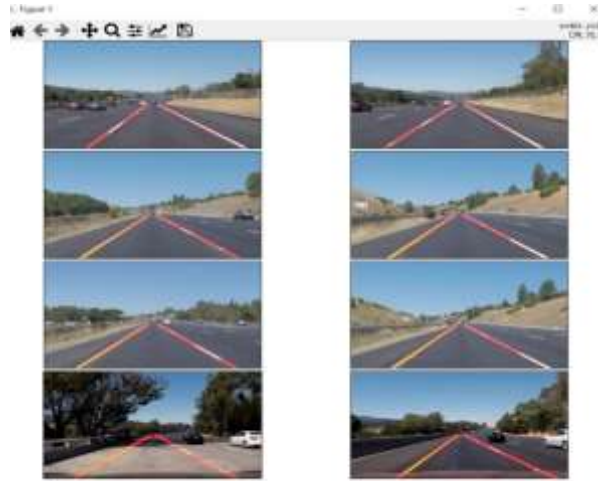
Fig.c.Output of Test images