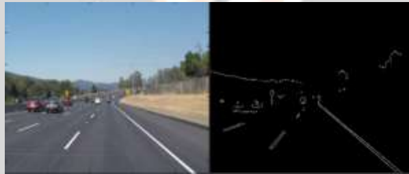
Fig.a.Canny edge output

Canny edge detection: The Canny filter is an edge detector with multiple phases. In order to measure the strength of the gradients, it uses a filter based on the derivative of a Gaussian. The Gaussian reduces the noise effect present in the picture. Then, by eliminating non-maximum pixels of gradient magnitude, possible edges are thinned down to -1 pixel curves. Finally using hysteresis threshold, edge pixels are maintained or removed.