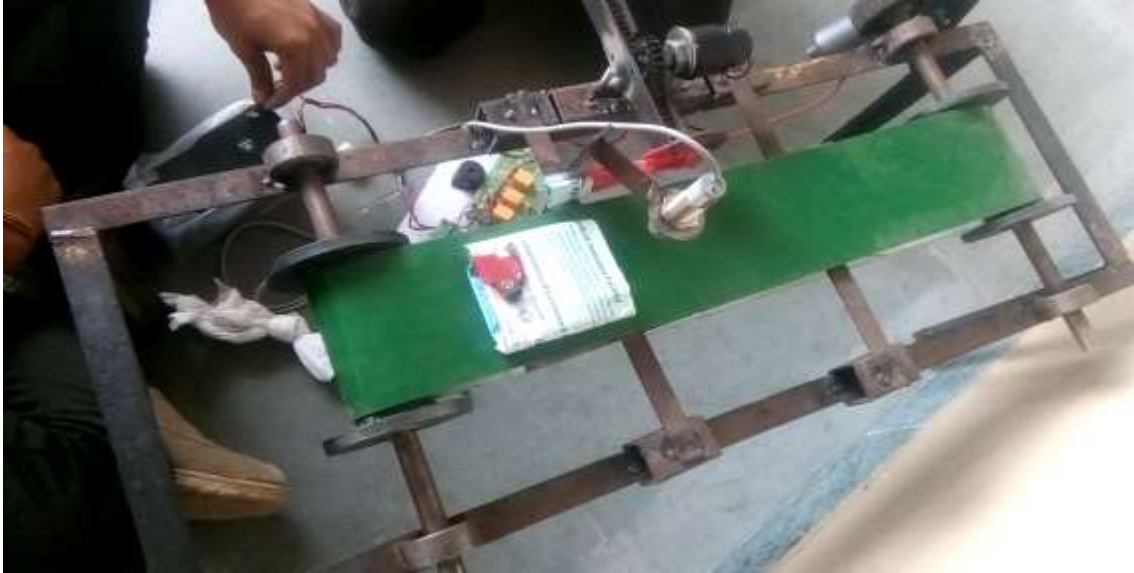
Fig. 3. Photo of Constructed System.