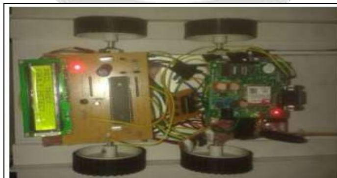
Fig-4.1: Before detection of the crack.

Robot continuously moves along the track to check whether any fault is present or not on the track as shown in figure 4.1.