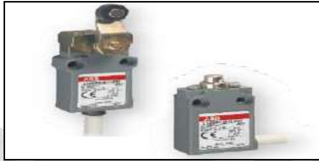
Fig 3.1: IR limit sensor

In our project IR Transmitter and Receiver circuit is used to sense railway track cracks and obstacles (2). There are 2 pairs of sensors used. It is used for obstacle detection. It has one transmitter and one receiver when any obstacle is present in this 2, it cuts the rays present between transmitter and receiver and give control signal to GSM Transmitter unit.