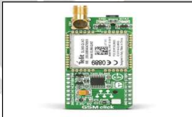
Fig 3.2: GSM Module

The modem can be used to make circuit switched data calls (CSD), making the unit suitable for remote dial-up systems where a fixed phone line is not available. The SMS functionality enables the sending and receipt of text messages. The unit connects directly to a PC or terminal device via the DB-9 RS232 Cable interface. The integral SIM card holder accepts standard SIM cards.