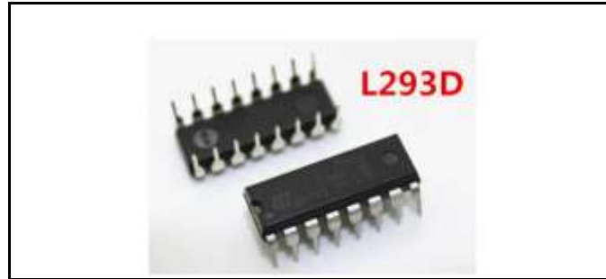
Fig 3.3: L293D Driver IC