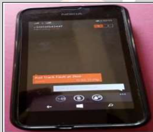
Fig.4.3: Message showing location of Fault