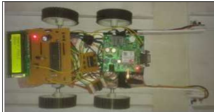
Fig-4.2: After detection of the crack.

When crack and any obstacle is detected, the robot will stop and the distance travelled by robot from a fixed point is displayed on LCD display as well as this distance is send to the control office through GSM modem(3).