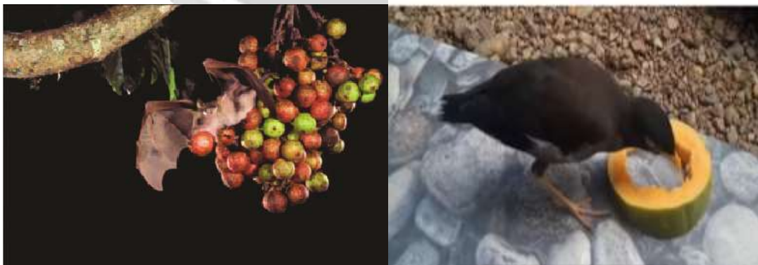
Fig -2: Prototype2

Be that as it may, the specific consideration ought to be paid to the harm brought about by fowls. As per Maharashtra Rajya Draksha Bagayatdar Sangh (MRDBS), The pinnacle assemblage of grape cultivators, around 4,500 sections of land of the absolute 1.25 lakh section of land reserved for grape development have been influenced by BATs/Indian myna menace. While the specific proportion of the misfortune in grape yield related with winged animals is in corer. ranchers incorporate various customary and ordinary methods to develop and store grains and organic products. A significant number of the pre-owned strategies bring about elimination of the uncommon feathered creatures. Along these lines, there is a need to create elective procedures, for example, exchange with the ranchers, grain stockpiling specialists and specialists in the fields of ornithology, farming areas and field visits, to keep away from irreversible damage to the Indian biodiversity. This examination breaks down the loss of yield of harvest because of fowls, investigates repulsing strategies embraced by the ranchers, and addresses the results of coordinated techniques on the flying creature biodiversity in India.