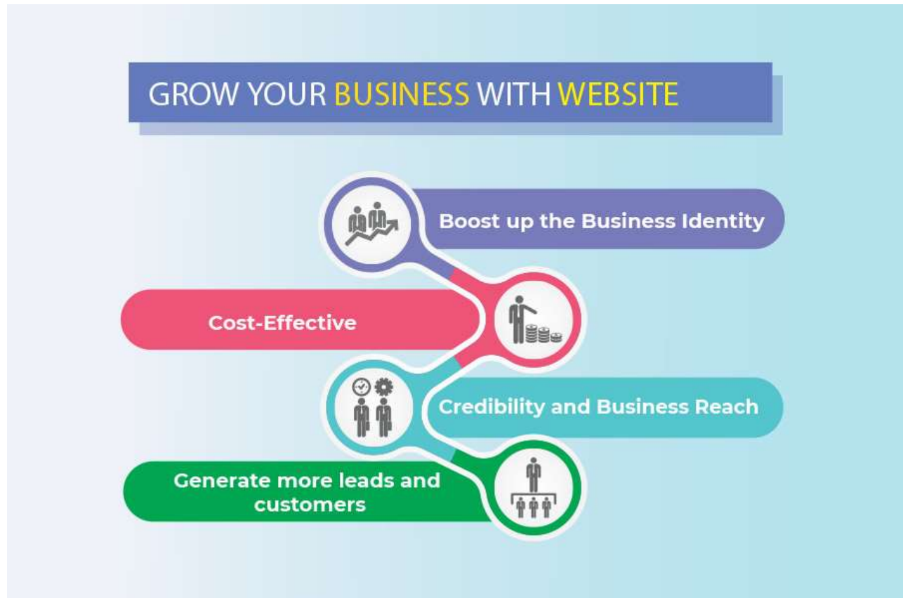
Fig-1: Importance of Business Website