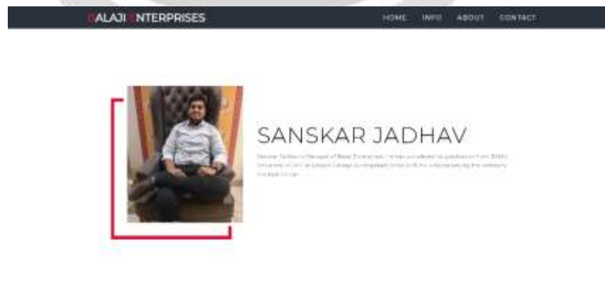
Fig-5: Team Page-II