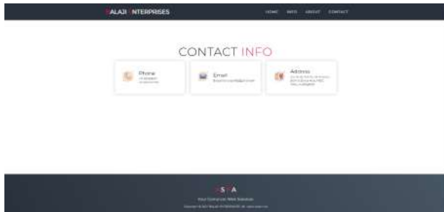
Fig-6: Contact info. Page

This page gives contact information of company.