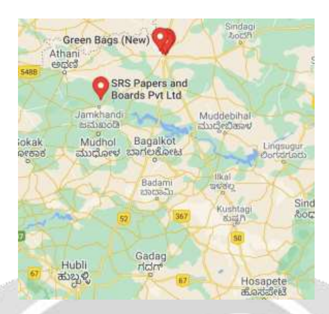
Figure 1. Paper and pulp industries in Bijapur.