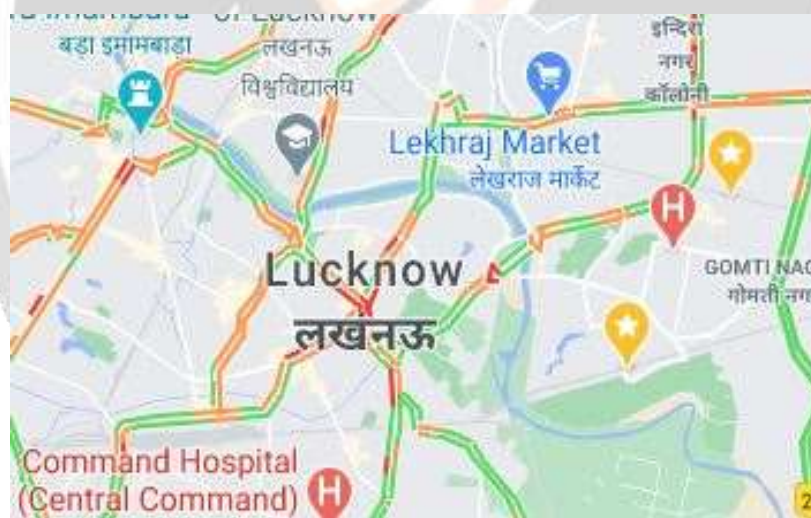
Fig-2.1: figure marked with yellow star showing the location of noise level measurement