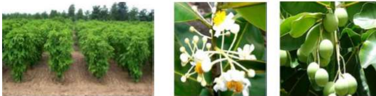
Fig- 1: Calophyllum Inophyllum L. tree flowers and fruits [8] & [9]

Fruit: The ball-shaped, light green fruits grow in clusters. Fruits are 2–5 cm (0.8–2 in) in diameter. The skin, which turns yellow and then brown and wrinkled when the fruit is ripe, covers the thin pulp, the shell, a corky inner layer, and a single seed kernel. Fruits are usually borne twice a year [8].