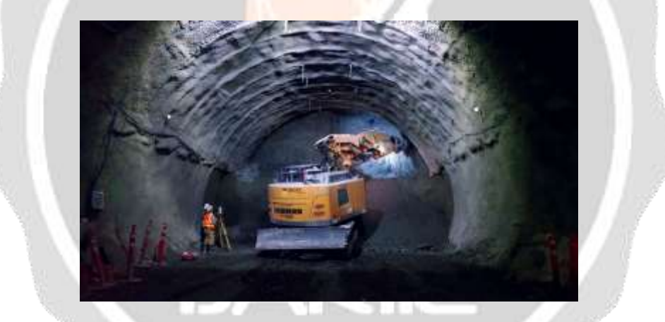
Fig -1 Excavation of the Tunnel

Excavation is the first activity for any construction. This activity engages machineries more than man power. This activity