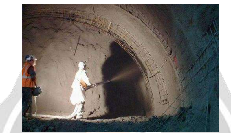
Chart -2: Shotcrete Activity

The three main types of primary support systems are presently used in tunnels. They are rock bolts, steel sets, and Shotcrete. Shotcrete is a pneumatically applied large-aggregate concrete. Each of the three support systems can be used under a wide range of tunneling conditions, with some limitations in the poorer quality rock.