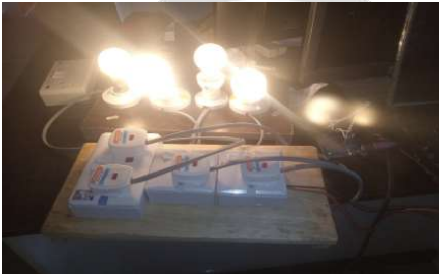
Figure. 3. System response when connected loads are within acceptable limits.

Figure 3. showed that each unit was powered up by the source. The system initially checked for overload in each of the power units. All the units were powered as soon as the source was energized. For the fact that a 100W lamp which was within safe limits of the system was connected to each unit, the Arduino sent signal to the relay module to switch on the loads.