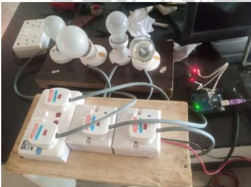
28 Figure 2. System physical architecture of the automatic load shedding and sharing power system

The Arduino UNO microcontroller is powered from a 12V, 1A DC power supply. The DC power supply is supplied from the mains where rectification, capacitor-based filtration and voltage stabilization take place. The rectification employed four IN4007 p-n diode connected as a bridge to convert the AC signal from the output of a step-down transformer to a DC signal. The rectified DC signal containing substantial ripples is fed into the capacitor to filter out voltage fluctuation. The filtered signal is fed into the voltage regulator, LM7812. The output of the voltage regulator delivered a constant 12V dc supply for the microcontroller.