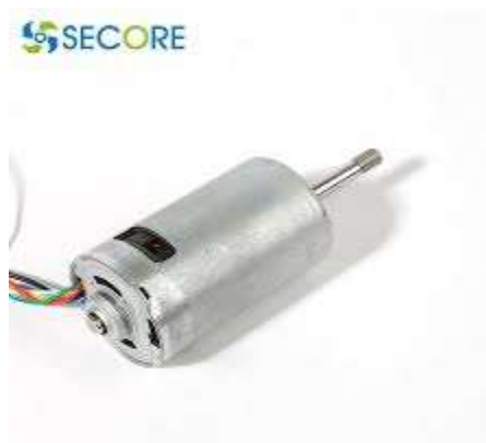
Fig; - DC Motor

A DC motor is an electric motor that is physically commutated and runs on direct current (DC). By definition, the stator and its current are both stationary in space. The commutator switches the current in the rotor such that it is also stationary in space. The highest torque is generated by keeping the relative angle between the stator and rotor magnetic flux approximately 90 degrees. A rotating armature winding (winding in which a voltage is induced) but a non-spinning armature magnetic field, as well as a static field winding (winding that produces the main magnetic flux) or permanent magnet, are found in DC motors. Distinct field and armature winding connections provide different speed/torque regulation features.