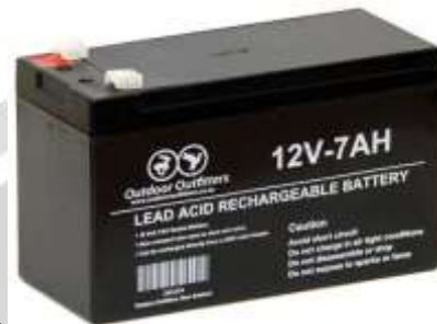
Fig; - DC Battery

Batteries convert chemical energy straight to electrical energy. A battery is made up of a certain number of voltaic cells. The chemical reactions take place in these voltaic cells, which are made up of certain chemical compositions. A conductive electrolyte comprising anions and cations connects two half cells in each cell. One half-cell includes electrolyte and the negative electrode, the electrode to which anions (negatively charged ions) migrate; the other half-cell includes electrolyte and the positive electrode to which cations (positively charged ions) migrate. The battery is powered by redox processes. During charging, cations are reduced (electrons are added) at the cathode, while anions are oxidized (electrons are withdrawn) at the anode. During discharge, the procedure is reversed. The electrodes do not touch one other, but are electrically the electrolyte connects.