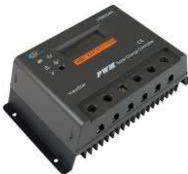
Fig; - Solar charger

Charge controller, voltage regulator, charge-discharge controller, or charge-discharge and load controller are all terms used to describe the power charge regulator. Between the array of panels, the batteries, and the equipment or loads, the regulator sits. The regulator avoids overcharging and over discharging by monitoring the voltage of the battery. Solar regulators should be linked in series to minimize overcharging and over discharging. Switches are used to connect and detach devices, and they can be electromechanical (relays) or solid state (bipolar transistor).