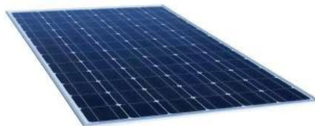
Fig; - Solar panel

Sun, also known as Sol by astronomers, is usually the most powerful source of light accessible. Some scientists refer to them as photovoltaic, which simply means "light-electricity." This is the foundation conversion of solar energy into electrical energy is known as photovoltaic conversion. A photovoltaic cell or solar cell is made Solar panels, as seen in are devices that transform light into power. They're named "solar" panels because the up of a mix of n-type and p-type semiconductors. All of these cells have a direct rate. desired, current that can be converted to alternating current. Future cells could make use of materials like the Gallium arsenate, copper sulphate, cad sulphide, and other semiconductors the device that was used to use the Solar cell is a photovoltaic effect.