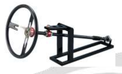
Fig. Steering set.

5. Solenoid type 5/2 dc valve: A solenoid valve is commonly used, a lever can be manually twist or pinch to actuate the valve, an internal or external hydraulic or pneumatic pilot to move the shaft inside, sometimes with a spring return on the other end so it will go back to its original position when pressure is gone, or a combination of any of the mention above.