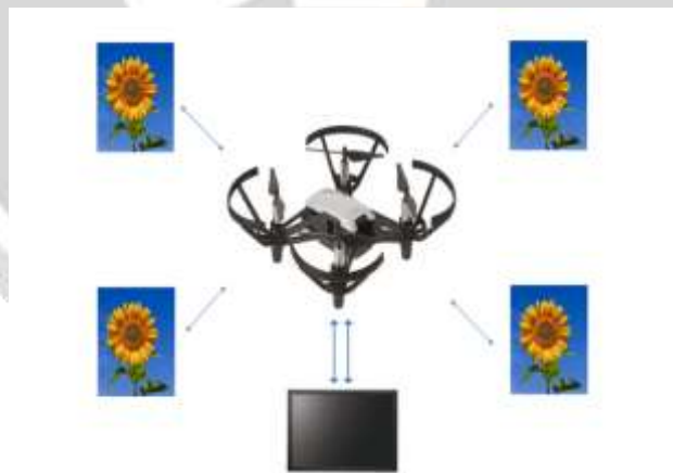
Fig -1: System Architecture