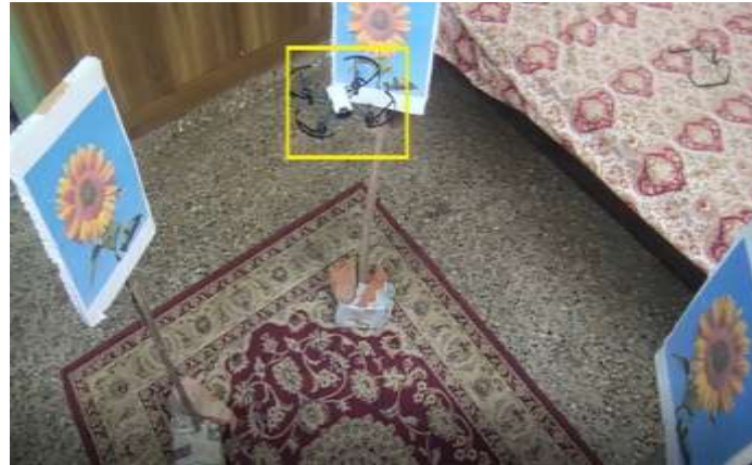
Fig -5: Pollination Drone

Fig 5: This drone is designed to perform pollination in an artificial method. This picture depicts the working of the drone. First the drone takes off with the “Take off” command. It goes up to 2-3 feet and then the search process begins where the drone rotates clockwise and then detects the flower. Once the “Flower” (object) is detected the center point of the flower is calculated and the drone moves towards the center point and performs the artificial pollination. After the completion of the pollination process, the drone moves back and continues the search process. When the next flower is detected, the process is repeated