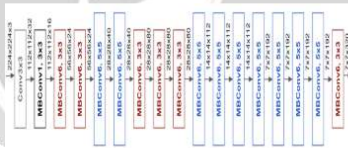
Fig -2: EfficientNet

EfficientNet is a convolutional neural network construction and the ascending way that consistently balances all sizes of depth, breadth, and resolution using a complex constant. Unlike conventional repetition that random scales these issues, the EfficientNet scaling method consistently scales net breadth, depth, and resolution with a set of static scaling constants. The efficiency of prototypical scaling also depends on the starting point of the network. So, to additional improvement of its performance, they have also advanced a new baseline network by executing a neuronic construction search using the "AutoML MNAS" basis, which enhances both correctness and effectiveness. The resultant planning uses portable overturned holdup convolution, parallel to 'MobileNetV2' & 'MnasNet', but is to some extent larger due to an enlarged 'FLOP' economical. They, then scale up the baseline network to obtain a family of models, called "EfficientNets". They have compared their "EfficientNets" with other current CNNs on "ImageNet". In general, the EfficientNet representations attain both sophisticated correctness and improved competence done present CNNs, dropping limit size and FLOPS by instruction of scale. However, EfficientNets complete fine on "ImageNet", to be utmost valuable, they should also transmission to additional datasets.