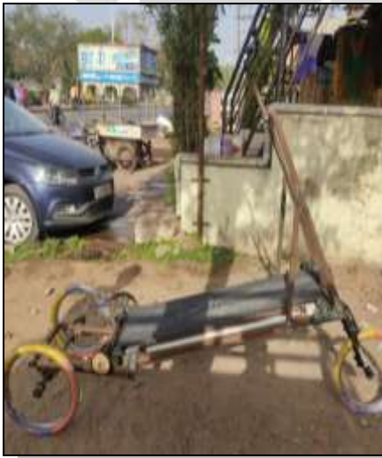
Fig-1: Actual Model (Side View)