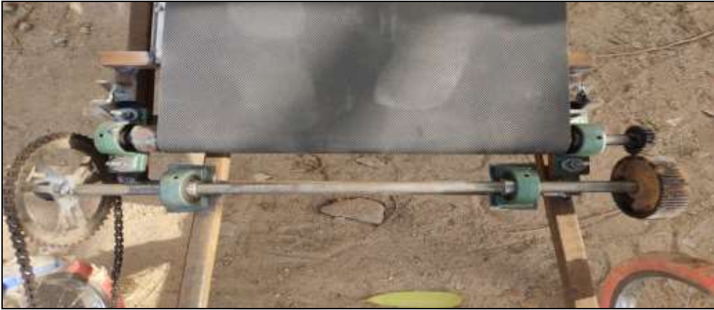
Fig-3: Transmission Mechanism