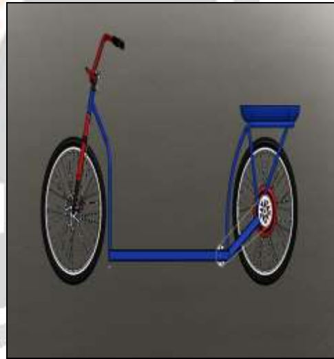
Fig-5: 3D Model Side View