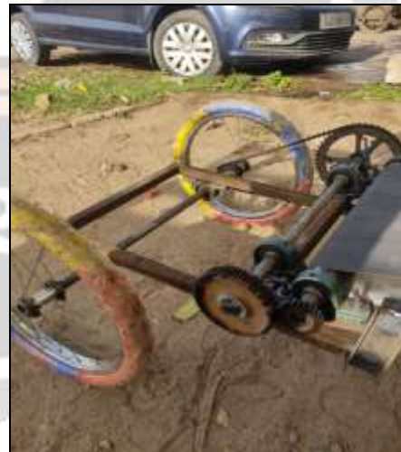
Fig-2: Actual Model (Rear View)