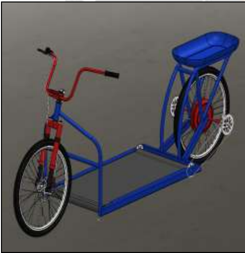
Fig-4: 3D Model using Solidworks software

The model consists of a base frame on which the components are fixed such as sprocket chain mechanism, spur gear mechanism and the roller. It consists of three tires, one in the front and two at the rear side. A handle is provided at the front for handling purpose. The below images show the 3D Model.