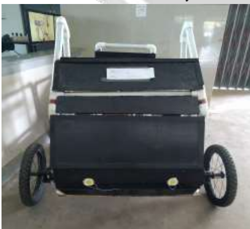
Fig.9: Front View