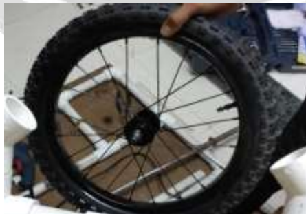
Fig. -5: Rubber Tires

We have used rubber tyres of size 200/50-100. Four tyres are used in our project. Each tyre can carry maximum load up to 200kg.