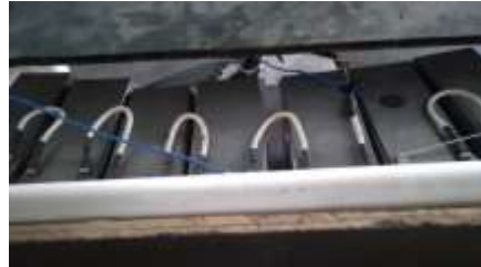
Fig.- 4: Lead Acid Battery

The lead-acid battery was invented in 1859 by French physicist Gaston Planet and is the earliest type of rechargeable battery . Despite having a very low energy-to-weight ratio and a low energy-to-volume ratio, its ability to supply high surge currents means that the cells have a relatively large power-to-weight ratio . These features, along with their low cost, make them attractive for use in motor vehicles to provide the high current required by automobile starter motors .