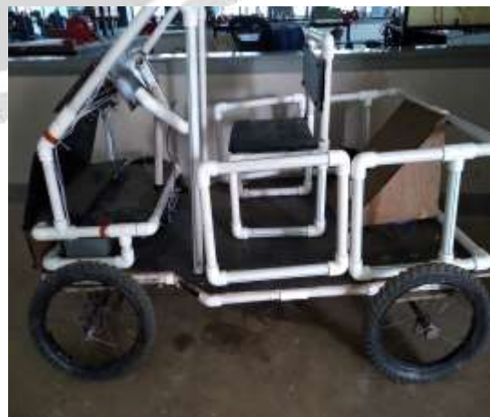
Fig.10: Side View