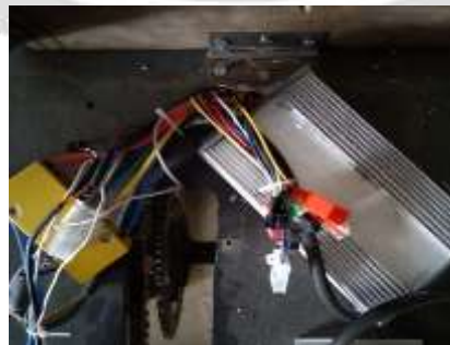
Fig.-3: Electric Drive

System employed for motion control is called drives it may employ any of prime movers for supplying energy for motion controls. Drives employing electric motors are called as electrical drives. A drive is a combination of various systems combined together for the purpose of motion control.