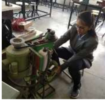
Fig.7: Vertical Drill