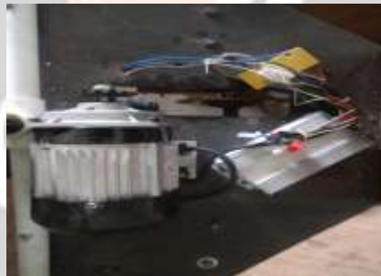
Fig -2: BLDC Motor

We have used two of these motors for the two respective rubber wheels. The motor is fixed to the back side of car. The motor is fixed with the help of nut and bolts. The motor is attached to the chain socket which rotates and rotates the wheels. The motor speed is controlled by the accelerator provided on front side of car.