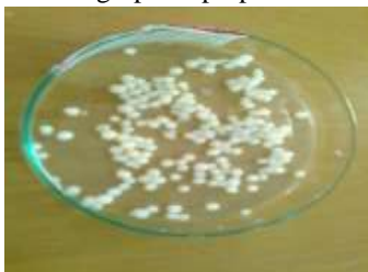
Figure- 1 Photograph of prepared microspheres

Batches of microspheres listed in table 1 were prepared by ionotropic gelation method which involved reaction between sodium alginate and polycationic ions like calcium to produce a hydrogel network of calcium alginate. Sodium alginate and the mucoadhesive polymer were dispersed in purified water (10 ml) to form a homogeneous polymer mixture. The API, Clarithromycin (100 mg) were added to the polymer premix and mixed thoroughly with a stirrer to form a viscous dispersion. The resulting dispersion was then added through a 22G needle into calcium chloride (4% w/v) solution. The addition was done with continuous stirring at 200rpm. The added droplets were retained in the calcium chloride solution for 30 minutes to complete the curing reaction and to produce rigid spherical microspheres. The microspheres were collected by decantation, and the product thus separated was washed repeatedly with purified water to remove excess calcium impurity deposited on the surface of microspheres and then air-dried shown in figure 1.