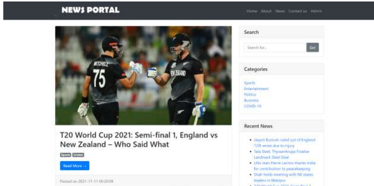
Figure [2]: User Module

Overall, the user module of a news portal plays a vital role in engaging users and providing them with a seamless experience while browsing and interacting with the content.