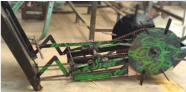
Fig 2 : “Working Mechanism”

Working- Paddy seedlings are kept in tray and allowed to flow down under gravity. The fork which is attached to shaft picks up the seedlings from the tray and keeps it in a horizontal position on the skid. The motion of the wheel and shaft is given by hand using chain and sprocket mechanism.