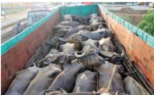
Fig.01. Overloading of cattle