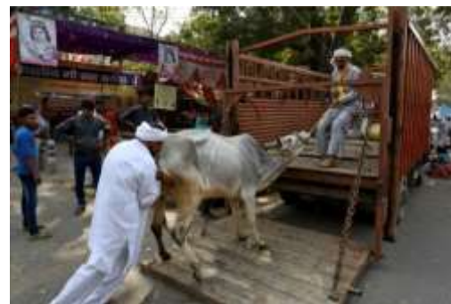
Fig.02. Improper loading facility