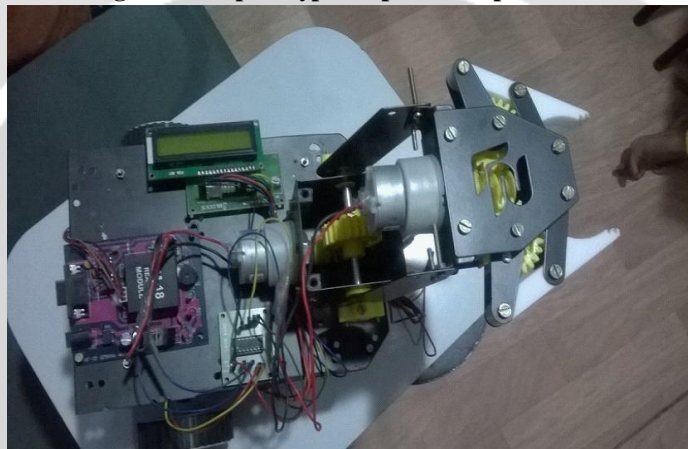
Fig 8. Final prototype of pick and place robot