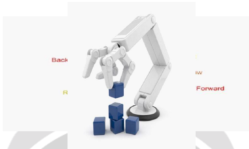
Fig 1. Axis of Rotation