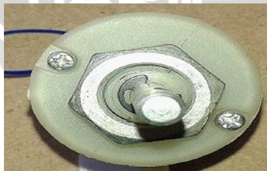
Fig 7. DC Motor

F] DC motor DC: geared motor 10RPM 12V are used for robotic application. It is very easy to use and available in the market. Motor operation based on electro magnetism . DC motors offer excellent speed and position control, long life, and high torque density. It gives higher efficiency and ability to withstand harsh environments.