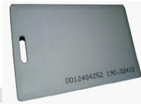
Fig 5. RFID Tag

D] RFID Tags: Radio frequency identification uses tags, attached to the object used to identified. RFID tag has a battery and it transmits ID signal periodically. It has a small battery on board and it is activated when RFID reader present in the system. A passive tag is cheaper and smaller because it has no battery. The tag stored in non-volatile memory.