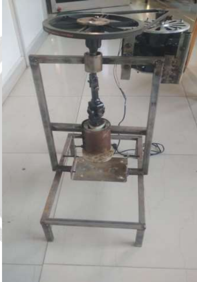
Figure : View of square hole drilling machine and special tool.