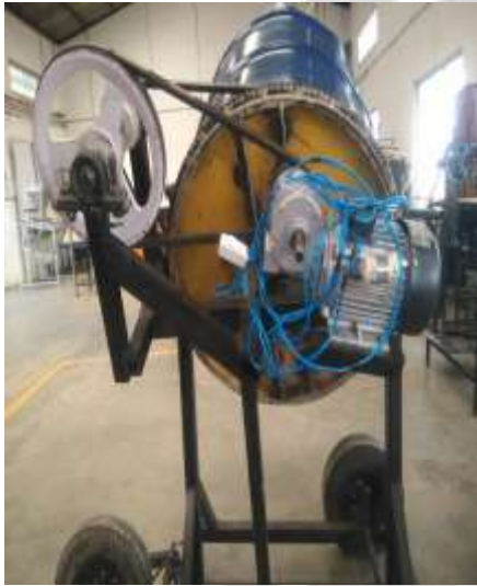
Different views of model