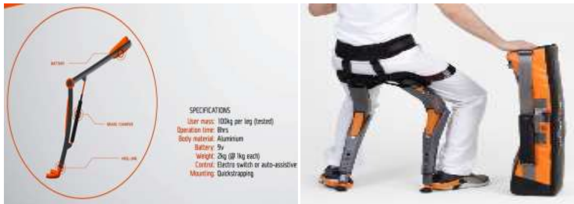
Fig:- The chairless chair of Noonee