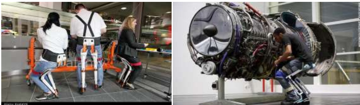
Fig: - Practical Application (Assembly Line)

Wearable chair is widely applicable in assembly line in industries where workers work for whole day by standing which will cause frequent tiredness and this results in low production rate.