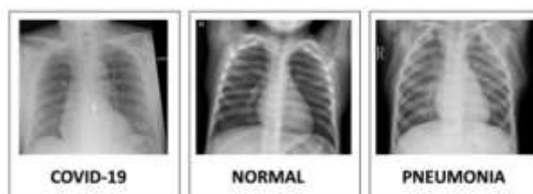
Fig:- Sample Dataset X-ray images

To validate the proposed method, we require two types of chest related x-ray images they are common x-ray image and the other one is covid affected patient x-ray image [1]. While chest X-ray images of common category had been collected from a GitHub or from Kaggle dataset which contains some images selected from Chest X-ray dataset. Granting them in a notable number of infected COVID-19 patients universally, but chest x-ray images that are accessible online are not mostly significant and dispersed. Kaggle chest X-ray data is a far-fetched popular database containing chest X-ray images of normal or healthy, viral, and bacterial- pneumonia. Positive and mistrust CORONA VIRUS images were acquired in open available resources. Lungs X-ray images for regular and effected with pneumonia were used from this gathering to generate the up to date database collection.