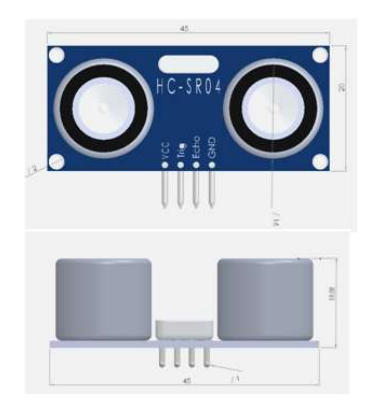
Fig3. Ultrasonic sensor

As shown above the HC-SR04 Ultrasonic (US) sensor is a 4 pin module, whose pin names are Vcc, Trigger, Echo and Ground respectively. This sensor is a very popular sensor used in many applications where measuring distance or sensing objects are required. The module has two eyes like projects in the front which forms the Ultrasonic transmitter and Receiver. The sensor works with the simple high school formula that