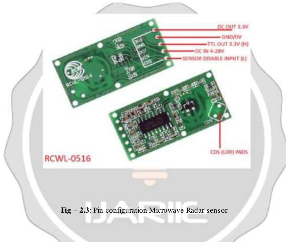
Fig – 2.3: Pin configuration Microwave Radar sensor

The primary purpose of the RCWL0516 microwave distance sensor is to replace PIR sensors, which utilise IR light produced by moving people. As a result, this type of sensor employs the Doppler Effect technique to detect moving objects. A distance sensor's primary purpose is typically to measure the target distance by sending high frequencies. Ultra-high frequency (UHF) and very high frequency (VHF) bands are available for electromagnetic waves like microwaves and are used for communication. Short microwaves are mostly utilised in detecting devices like radars, alarm systems, and human body detectors.