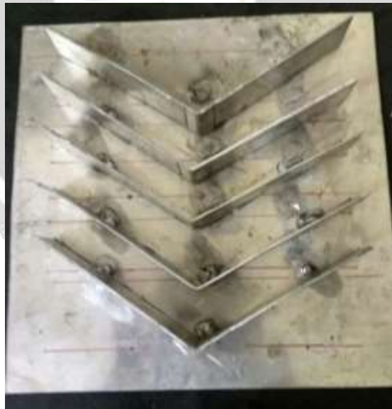
Fig-2. V-Fin Pattern