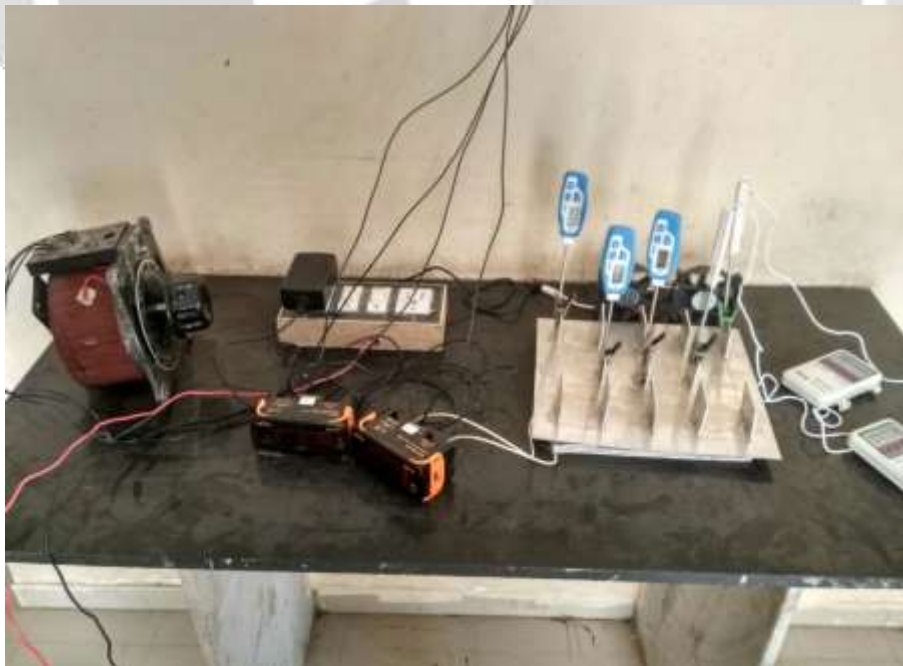
Fig-5. Experimental setup

3.2.8 Nichrome wire Nichrome is a non-magnetic alloy of nickel, chromium, and often iron, usually used as a resistance wire. A common alloy is 80% nickel and 20% chromium, by mass, but there are many others to accommodate various applications. It is silvery-grey in colour, is corrosion-resistant, and has a high melting point of about 1,400 °C (2,550 °F). Due to its resistance to oxidation and stability at high temperatures, it is widely used in electric heating elements, such as in appliances and tools. Typically, nichrome is wound in coils to a certain electrical resistance, and current is passed through it to produce heat.