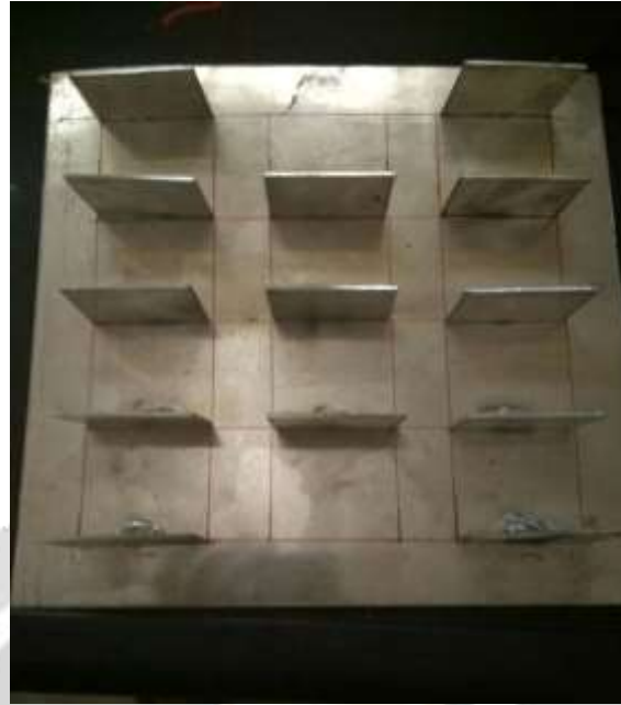
Fig-3. Split Fin Pattern