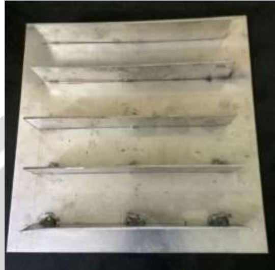
Fig-1. Parallel Horizontal Fin Pattern

All three fins are made of Aluminium 1100's sheet of width 3mm. Base plate dimension of cooling fin pattern are same is all pattern (i.e. 200mm×200mm). 'Parallel horizontal fin pattern' has 5 horizontal fins of dimension 200mm×40 welded by GTAW (Gas Tungsten Arc Welding) and arranged on the base plate with equal pitch distance. 'V-fin pattern' are made by bending the 200mm×40mm Al-plate from center at an angle of 120° number of fins in this case is same as in parallel horizontal fin pater i.e. 5-fins on the base plate with equal pitch distance. For making 3rd patter 'Split fin pattern' fin of dimension 50mm×40mm is used and welded on the base plate actual pics of pattern are shown below: