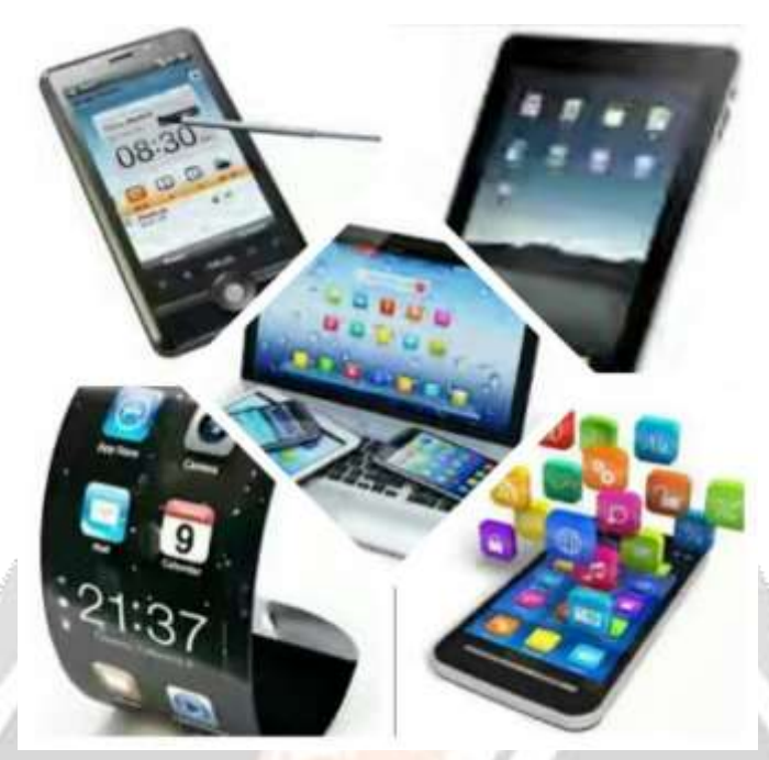
Fig 2: Mobile Computing Devices