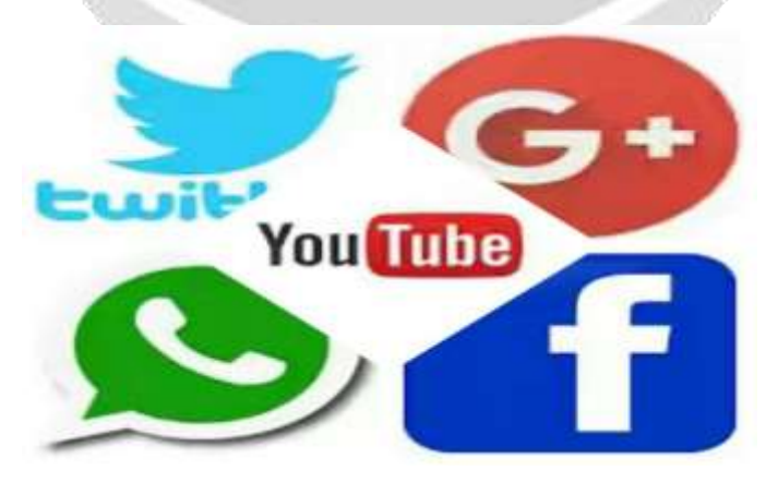
Fig 3: Social Media

Two way communication: Traditional marketing techniques followed by small businesses are generally one way communication for marketing like delivering marketing messages in mail boxes, promotion on television, radio etc. In these technique customers have no opportunity to provide their feedback. Only business houses are promoting their products but by following social media strategy there is a two way communication between businesses and customers. Now customers are able to provide feedback about the product or can dialogue with the company's representative over the social media like Facebook. Efforts on Social media platform also give organizations a digital personality, global presence and effective branding technique.