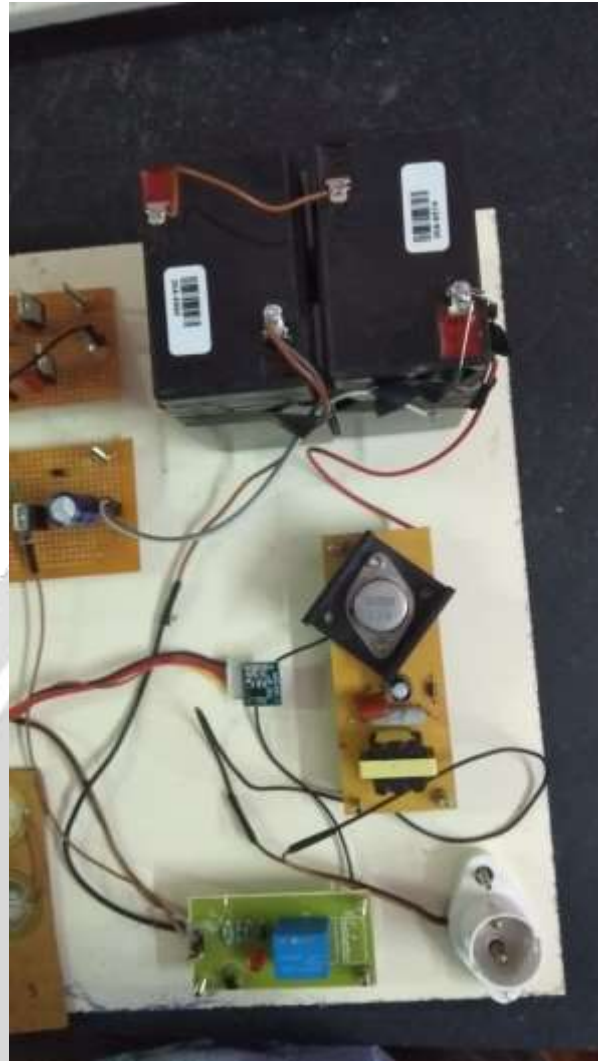
Figure.5. Image showing Unknown Interruption