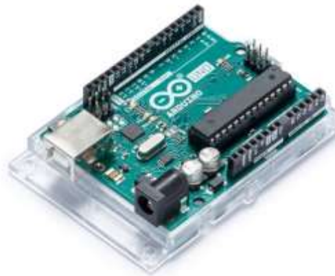
Figure.2. Arduino UNO

SoC Built specifically for the new UNO, the Broadcom BCM2837 system-on-chip (SoC) includes four high-performance ARM Cortex-A53 processing cores running at 1.2GHz with 32kB Level 1 and 512kB Level 2 cache memory, a VideoCore IV graphics processor, and is linked to a 1GB LPDDR2 memory module on the rear of the board.