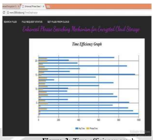
Figure 3: Time efficiency graph.

The time diagram demonstrates the comparison between the keyword pursuit and phrase look. What's more, it demonstrates that the phrase time for each pursuit is not as much as the keyword time.