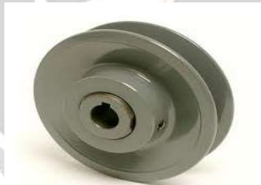
Fig- 3.3 Pulley

Hero of Alexandria identified the pulley as one of six simple machines used to lift weights. Pulleys are assembled to form a block and tackle in order to provide mechanical advantage to apply large forces. Pulleys are also assembled as part of belt and chain drives in order to transmit power from one rotating shaft to another.