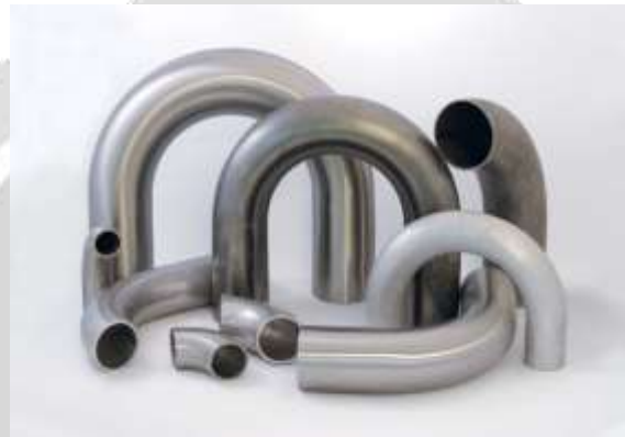
Fig: 2.1 Tube Bending

The Forming Roller method of tube bending is recommended for all large bends where the centerline radius is at least 4 times the outside diameter of the tube. It can also be successfully employed for bending pipe or heavy wall tubing to smaller radii and is the most practical method of bending very small diameter tubing.