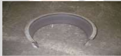
Fig: 2.4 Channel Bending

The same general bending rules which cover the forming of channel with “flanges out” also apply when it is formed with “flanges in.” Since it is necessary to compress the flanges as they are bent inward, the operation shown below requires considerably more bending pressure than when forming with the “flanges out” and it is recommended that the largest possible radius be used to allow for compression of the material. If a sharp 90° bend is desired, it can be obtained by cutting a notch out of the channel flanges before forming around a special Zero.