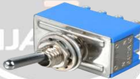
Fig: 3.5 on /Off Switch

For this reason, power switches intended to interrupt a load current have spring mechanisms to make sure the transition between on and off is as short as possible regardless of the speed at which the user moves the rocker. Power switches usually come in two types. A momentary on-off switch (such as on a laser pointer) usually takes the form of a button and only closes the circuit when the button is depressed. A regular on-off switch (such as on a flashlight) has a constant on-off feature. Dual-action switches incorporate both of these features.