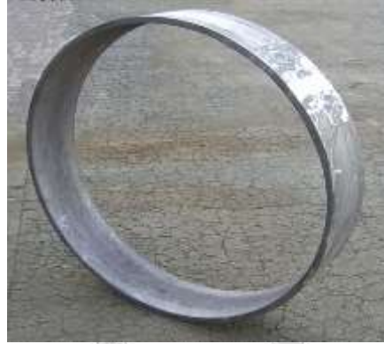
Fig: 2.3 Circle Bending