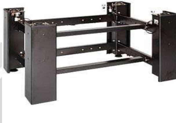
Fig- 3.1 Support Frame

To place things like solar panels or bundled cables on a support frame and not have them dislodged when the support frame moves, use Panels. While items like these can be placed on a cover, they will not stick when the support frame is moved.