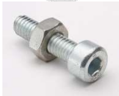
Fig – 3.4 Nut and Bolt

Where a fastener forms its own thread in the component being fastened, it is called a screw. This is most obviously so when the thread is tapered (i.e. traditional wood screws), precluding the use of a nut, or when a sheet metal screw or other thread-forming screw is used.