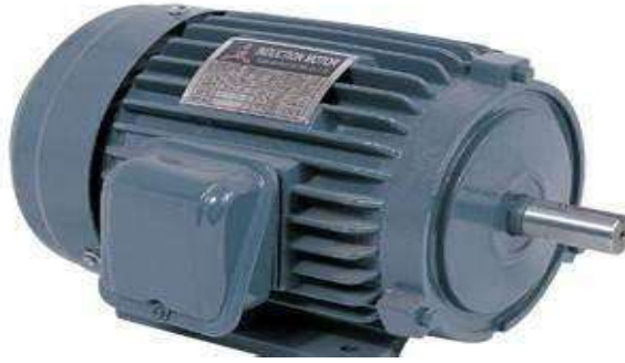
Fig- 3.2 Ac Motor