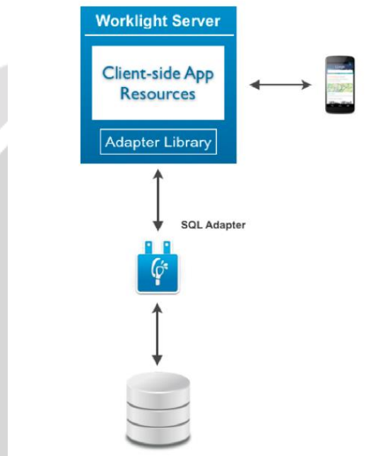
Fig : Flow Graph