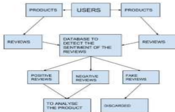
Fig: The Process of Product Review Analysis.

Before purchasing anything, it is a normal human behavior to do a survey on that product. Based on reviews, customers can compare different brands and can finalize a product of their interest. These online reviews can change the opinion of a customer about the product. If these reviews are true, then this can help the users to select proper product that satisfy their requirements. On the other hand, if the reviews are manipulated or not true then this can mislead user. This boosts us to develop a system which detect fake reviews for a product by using the text and rating property from a review. The honesty value and measure of a fake review will be measured by using the data mining techniques. An algorithm could be used to track customer reviews, through mining topics and sentiment orientation from online customer reviews and will also blocked the fake reviews.