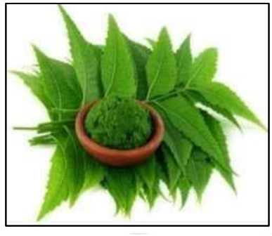
Figure no. 2