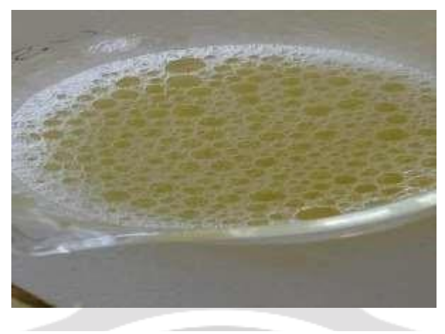
Figure no. 6 Foamability Test

Foamability: Small amount of gel was taken in a beaker containing water. Initial volume was noted, beaker was shaken for 10 times and the final volume was noted.