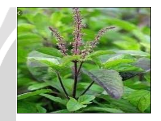
Figure no. 1