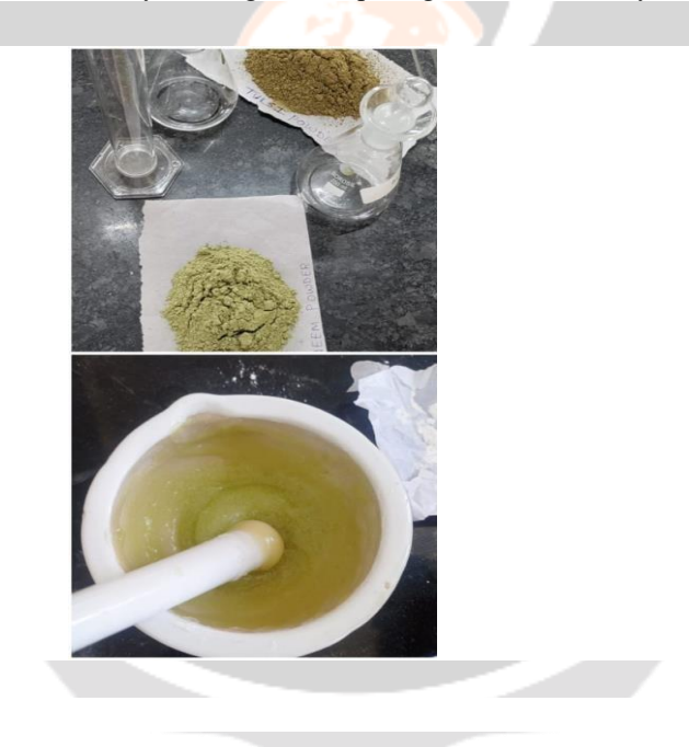
Figure no. 4