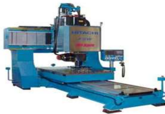
Figure: FSW machine

Friction Stir Welding (FSW) is a solid-state joining process that creates extremely high-quality, high-strength joints with low distortion. A non-consumable spinning tool bit is inserted into a work piece. The rotation of the tool creates friction that heats the material to a plastic state. As the tool traverses the weld joint, it extrudes material in a distinctive flow pattern and forges the material in its wake. The resulting solid phase bond joins the two pieces into one.