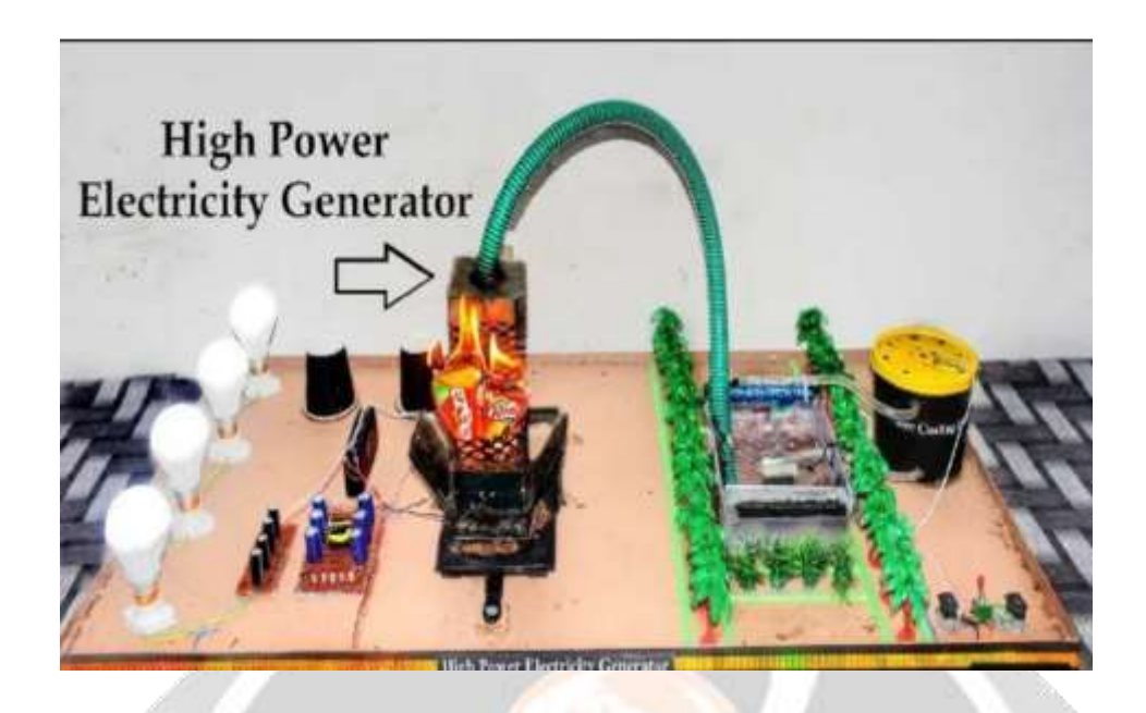
Fig-2: Overview of Project