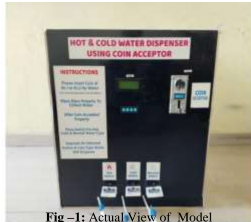
Fig -1: Actual View of Model