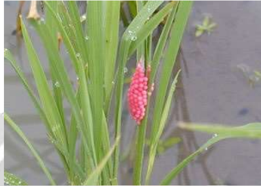
Figure 7. Golden snail eggs Source: [10]

The female snail will deposit a collection of bright pink eggs attached to a solid surface (stones, walls, logs, plants emerging from the surface of the water, garbage) to a height of 50 cm above the water surface. The eggs usually hatch in 7-15 days, but it can take longer depending on the ambient temperature. Reproductive output in a clutch of eggs can be enormous. A clutch of eggs may produce 1000 eggs but generally has an average of 200-300 eggs. Golden snail eggs are released every few weeks [1].