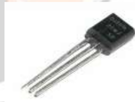
Fig 2. Temperture sensor

TMP103 is the advanced yield temperature sensor in four ball wafer chip-scale bundle (WCSP). It is fit for perusing the temperature to determination with 1 0 c .