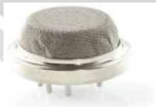
Fig 3. Gas sensor

This sensor is accustomed to leakaging the gas for identifying the types of gear in ventures, family... and so on which are reasonable for distinguishing the LPG gas, Alcohol, hydrogen smoke. The figure underneath demonstrates the gas sensor module is utilized as a part of the framework.