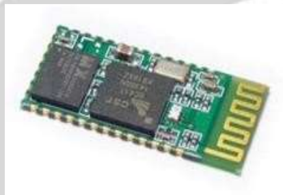
Fig5. Bluetooth module.

HC-05 Bluetooth Module is anything but difficult to utilize the Bluetooth SPP module, that proposed for clearing the remote serial association setup. It happens through the serial correspondence which makes a fundamental method to manage interface and controller or PC. HC-05 Bluetooth module gives exchanging mode among ace and slave mode which inclines toward additional to utilize neither getting nor transmitting the information. The figure beneath demonstrate the Bluetooth module utilized as a part of our task.