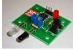
Fig4. IR sensor.