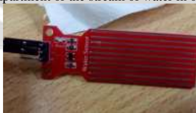
Fig 6: Water level sensor

It is utilized for estimation of liquid level called as level sensor. The detecting test component comprises of wire link. Level sensors are utilized to recognize the level of substances that can stream. Such substances incorporate fluids, slurries, granular material and powders. ... Such estimations can be utilized to decide the measure of materials inside a shut compartment or the stream of water in open channels.