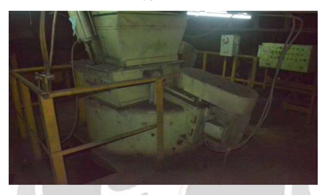
Fig. 3.1 Foundry sand mixer used in HSP line

Table 1- Mixing process characterization