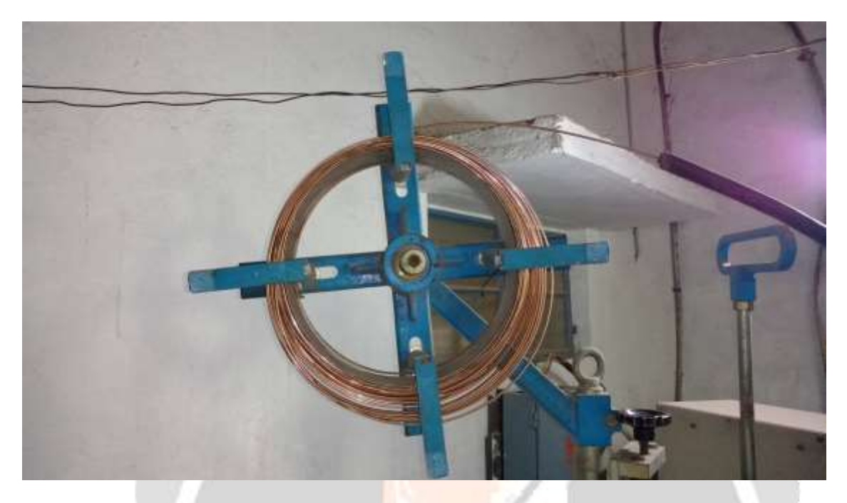
Fig. 5.1 EL8 Electrode Wire

Electrode EL8 is selected as hardfacing alloy used for overlaying. These alloy is selected due to its low cost and easy availability in the local market and suitability for the service condition (low stress abrasion). They are basically iron based alloys having varying amount of chromium, carbon, silicon and other alloying elements as they are more suitable for submerged arc welding process. Chemical compositions of the electrode are presented in Table 5.1.