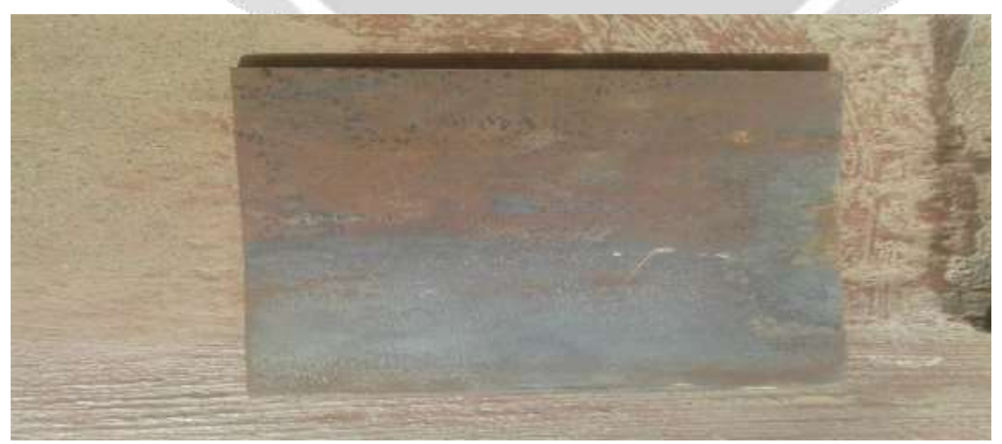
Standard test specimen of size

The experiment was carried out to investigate the effect of current, travel speed and voltage on hardfacing electrodes, and the corresponding hardness was determined. Standard specimen of size 200X80 mm used for the test is shown in figure. Also Process parameters selected for the process is shown in table