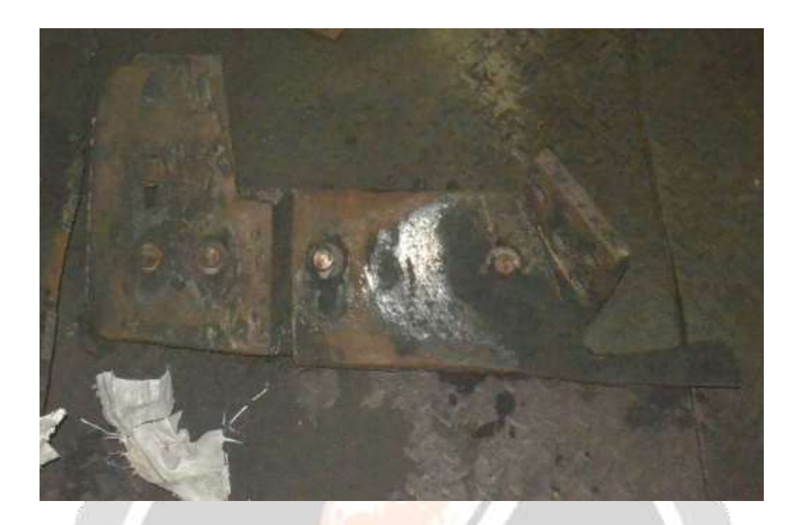
Fig 4.3.1. Worn Mixer Blade