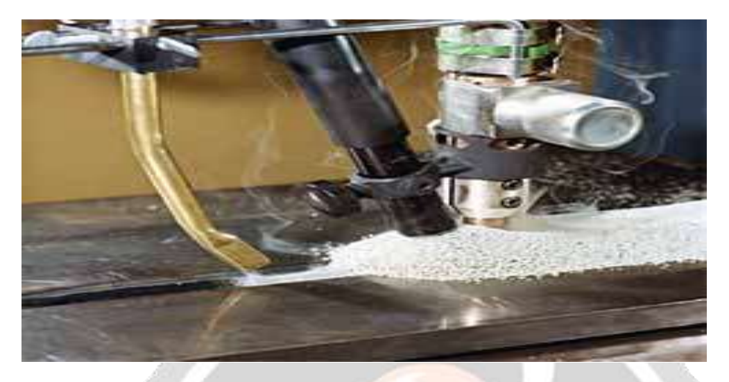
Figure 5.2 Agglomerated flux

surface. To avoid this, the recirculating system should be equipped with filters to remove both large particles of detached slag and the fine dust.