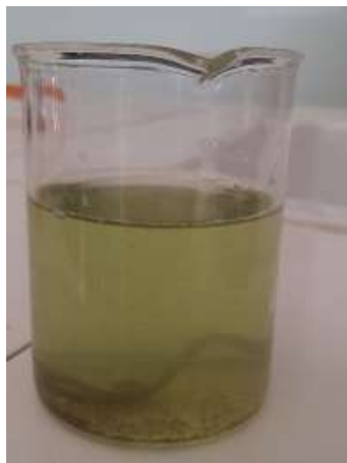
Figure 6. EEPE 10mg/ml