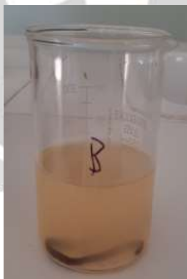
Figure 4. Albendazole 30mg/ml