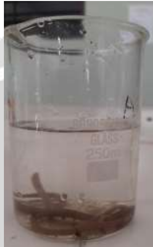
Figure 2. Control saline