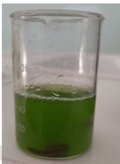
Figure 7. EEPE 30mg/ml