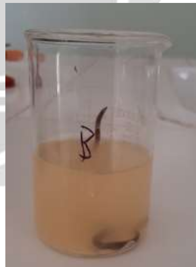
Figure 5. Albendazole 50mg/ml