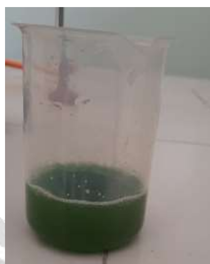
Figure 8. EEPE 50mg/ml