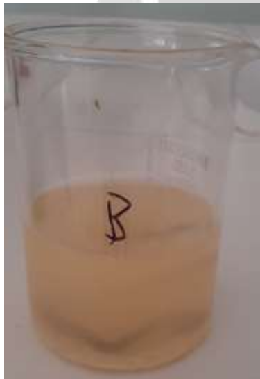
Figure 3. Albendazole 10mg/ml